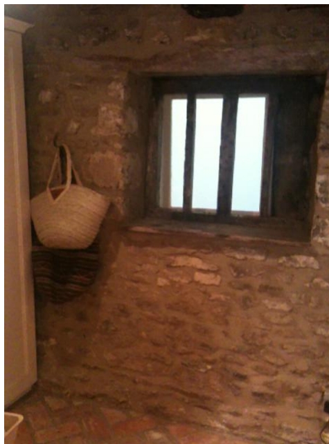
Window with vertical slats, no glass