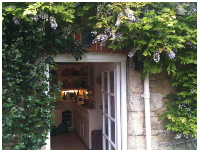
Insurance plaque above kitchen door